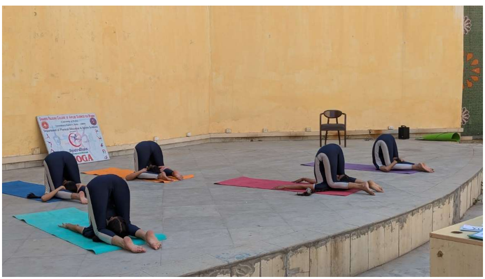
Girls' Traditional Team Yogasana Competion